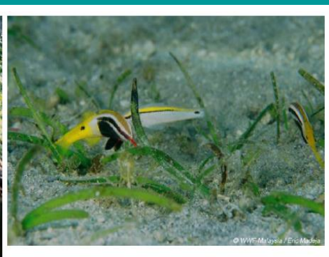
Increasingly rare are places like the proposed TMP where relatively intact coastal and marine ecosystems such as coral reefs, mangroves and seagrass beds exist and function together perfectly to provide important fisheries resources, coastal protection and aesthetic enjoyment.